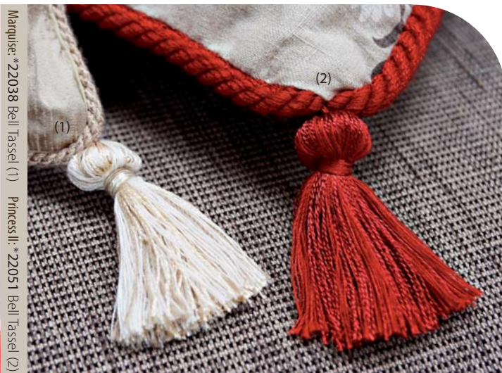
Marquise: *22038 Bell Tassel (1)