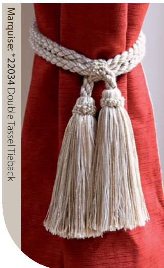
Marquise: *22034 Double Tassel Tieback