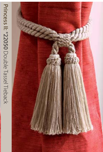
Princess II: *22050 Double Tassel Tieback