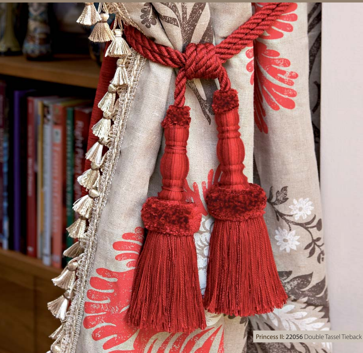
Princess II: 22056 Double Tassel Tieback