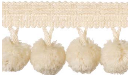
22064 Pom Fringe