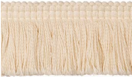
22015 Brush Fringe